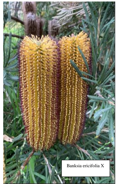
Banksia ericifolia X