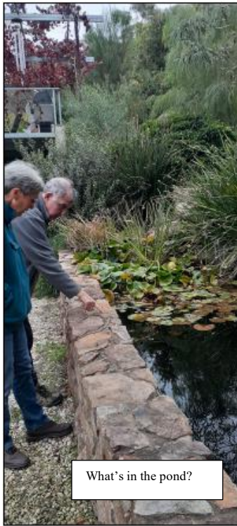
What's in the pond?