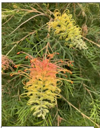
Grevillea Peaches n Cream